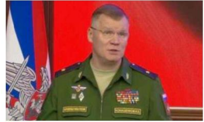
რუსი გენერალი კონაშენკოვი კიეველებს მიმართავს: თქვენი გამოყენება უნდათ ცოცხალ ფარად!